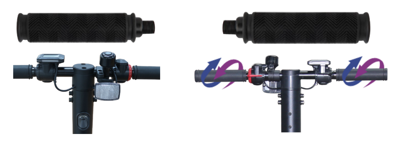
Figure 1 Figure 2