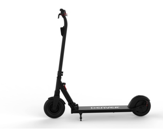
Folding the scooter

4) The electric scooter is unfolded as soon as you hear the rod clicks into place.